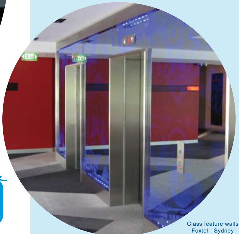
Glass feature walls Foxtel - Sydney

To make it easy to specify EnduroShield™ for your next project, a two page specification on each product is available to download at: www.enduroshield.com/specifications